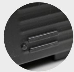
Stackable and non-slip