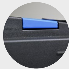
Interchangeable safety latches