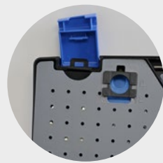
Divider panel with locking mechanism