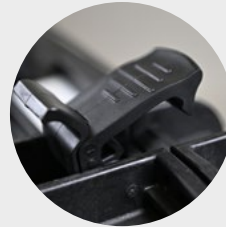
Two-way folding latches

DIN 1814, DIN 2181, DIN 2184-1, DIN 5157, DIN EN22568 and DIN EN24231.