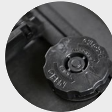
Water- and dustproof