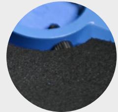
European certified foam